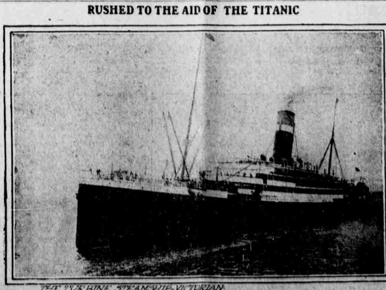
THE TITANIC STEAMSHIP VICTIM

"At the last moment Captain Smith gave the order, 'Every man for himself now,' declared one of the surviving members of the Titanic's crew. "We jumped. Thirty of us managed to get aboard a capsized lifeboat. No passengers were sacrificed that any member of the crew might be saved."